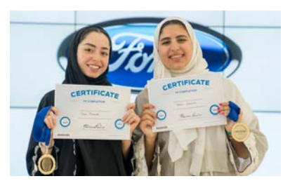
Driving Skills for Life for Her in Saudi Arabia