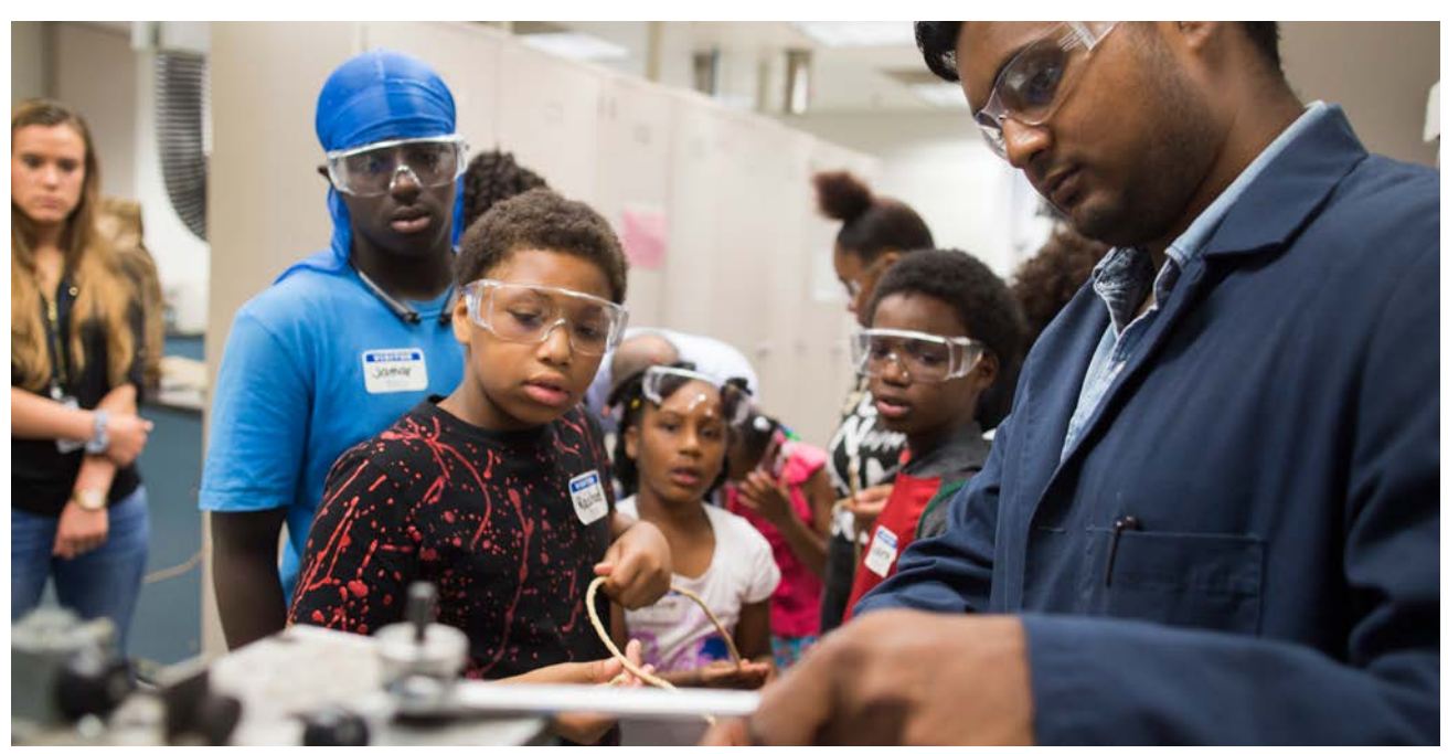
Detroit students learn from Ford engineer

Since 2012, Ford Driving Dreams has been supporting students in underserved communities across the United States, Puerto Rico and Latin America – inspiring them to achieve academic success via scholarships and motivational programs that encourage them to stay in school and continue to college. In 2018, the program expanded to Orlando, Florida, and reached a milestone when it launched in Mexico City, partnering with the Ford Dealers Civic Committee to support the nearly 200 Ford schools they have built across Mexico.