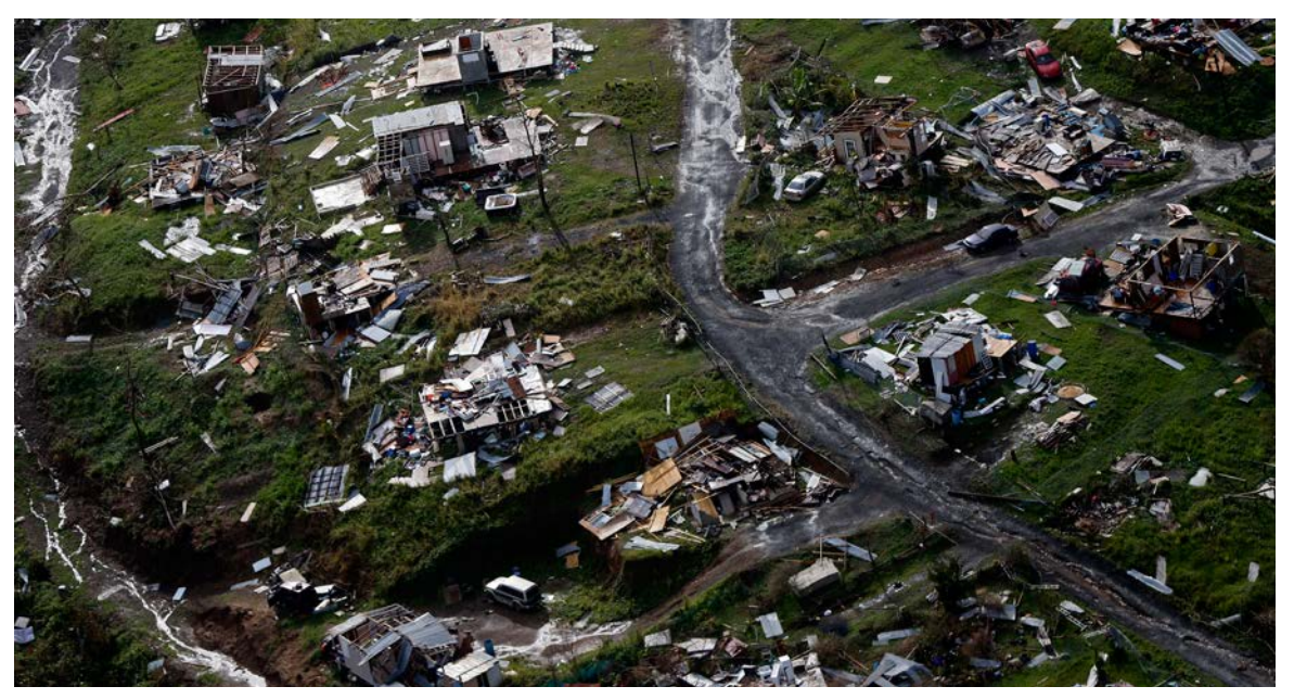
Destroyed communities are seen in the aftermath of Hurricane Maria in Toa Alta, Puerto Rico.

In 2018, Ford Fund again held its Ford Disaster Relief Mobility Challenge. The program awarded four U.S. nonprofits a $70,000 grant each to purchase and customize a Ford Transit cargo or passenger van to help meet specific needs of their communities in preparing for or responding to natural disasters. Winners include: