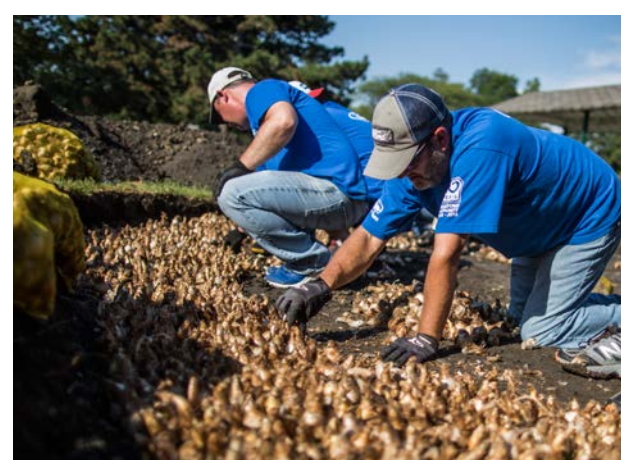
Employees planting daffodils on Belle Isle in Detroit