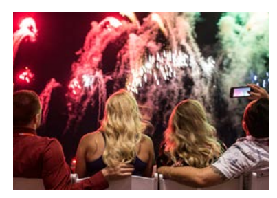
Ford Fireworks in Detroit