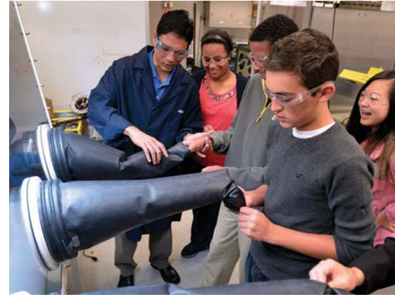
Next Generation Learning students visit Ford Research and Innovation Center