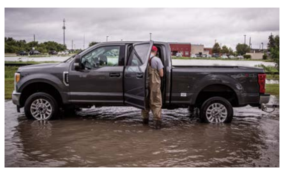
Ford Fund matched employee and dealer contributions to support Team Rubicon's relief efforts for Hurricanes Florence and Michael.

When Puerto Rico was hit by two hurricanes in late 2017, Irma and Maria, Ford established pop-up community centers to provide food, water, clothing and transportation in devastated communities across the island. While this support continued throughout 2018, Ford Fund expanded its efforts to also provide longer term recovery assistance through medical and mental health services, educational grants and skills development — for people on the island and those who migrated to Central Florida as well.