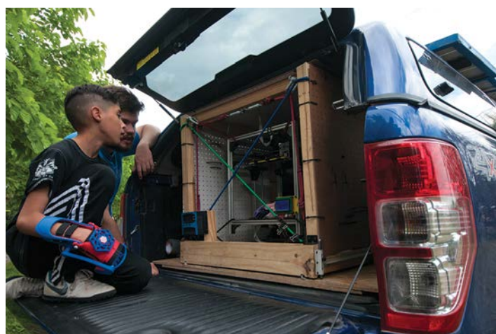
Argentina Limbs Project with Atomic Lab