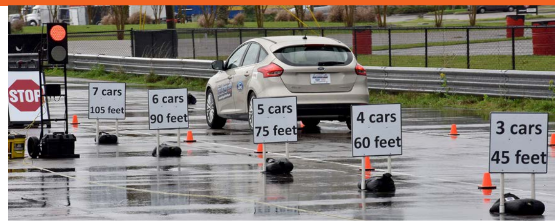
Hazard recognition and anti lock braking exercise

Ford Driving Skills for Life's hands-on training is fully customizable to each country for cultural differences, laws and infrastructure. In India, the program talks about honking your horn and how increased noise levels interfere with emergency vehicle sirens. In other countries, drivers are taught not to overload their vehicles with people or possessions.