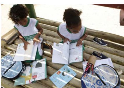
Brazil backpack program