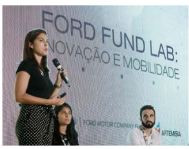
Ford Fund mobility lab in Brazil